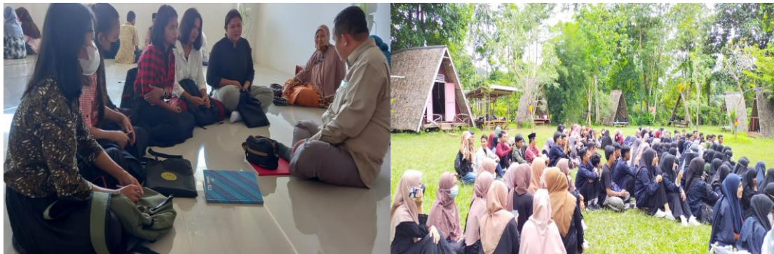
Figure 2. Muslim and non-Muslim Student Assistance (outbound-class)

If it is analyzed, religious moderation education is programmed in the al-Islam Kemuhammadiyah curriculum and integrated with other courses contained in Learning Outcomes, as well as Hidden Curriculum, which is interpreted as curriculum content or confidential material (Waseso & Sekarinasih, 2021). The hidden curriculum in the proper context will impact students' knowledge, beliefs, behavior, and skills (Alsubaie, 2015).