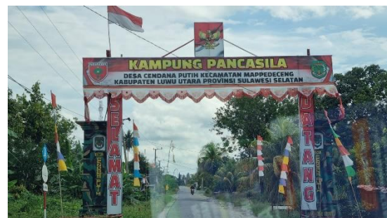
Figure 3. Pancasila village in North Luwu

It is the role of these socio-religious institutions, namely religious leaders, traditional leaders, youth leaders, the government that really facilitate citizens without discrimination, so that all feel protected and accept one another. In fact, some of them have even married and become a family bonding factor that strengthens one another.